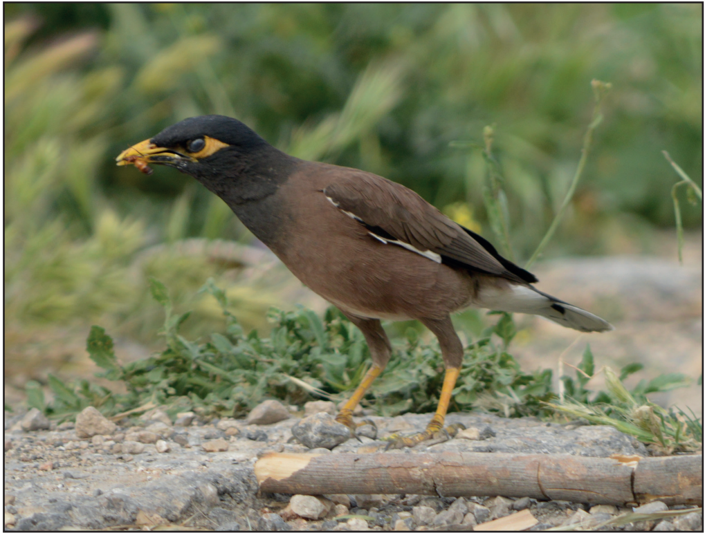
Plate I. Common Myna Acridotheres tristis .