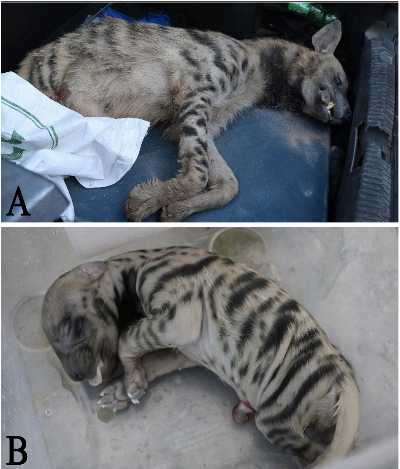
Figure 3. A: Hyena killed by a local from Al Ramadeen, B: A near-term male fetus from the dead female.

sniffing the ground and the air. On a visit week later, the researchers found tracks of the same hyena (judging by the foot print size) approximately 2 km to the west of the release site in the wooded areas near an outcropping of limestone dotted with caverns. The researchers left some food in the area one more time. This first-recorded successful release of