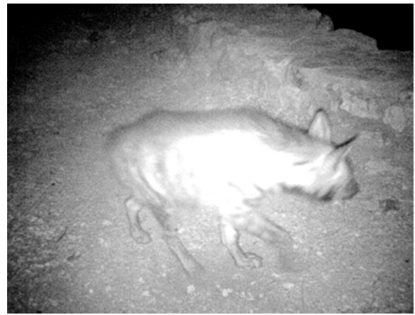
Figure 2. The Striped Hyena from Al Makhroul Valley using a night camera trap.

On February 13, 2020, the EQA brought one female hyena that was killed by a poacher and dragged behind a car. Upon autopsy, this hyena was found pregnant with