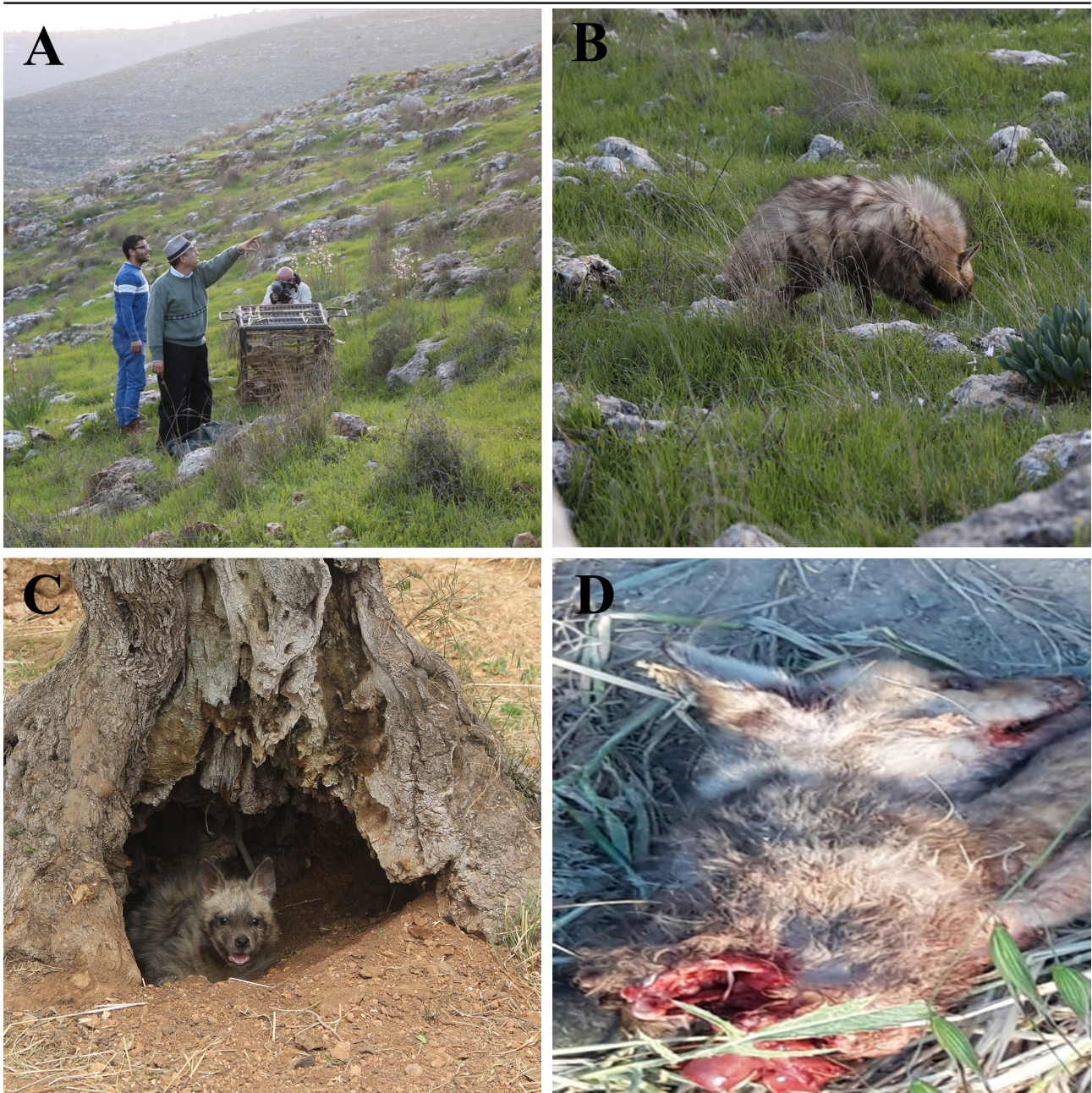
Figure 4. A-B striped Hyena released in an area to the West of Bethlehem District, C: The hyena dug under an olive tree in the enclosure during rehabilitation, D: A fox eaten by a hyena.

and environmental education and awareness in the Palestinian territories. Their efforts include animal rehabilitation and release. Their teams work with school students to create a new generation of people that respect nature to prevent and decrease infringements on wildlife. The successful story of rehabilitating and releasing a striped hyena to the wild (first of its kind in Palestine Figure 4) coupled with the pictures of the baby hyena (Figure 3) produced educational lessons. In fact, this was translated to an educational module to increase the awareness about the importance of protecting the hyena (Figure 5).