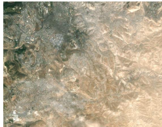
Figure 1. Area of Bethlehem covered in the present study.

Note encroachment of desertification from the East and dense urbanization in the Western areas.